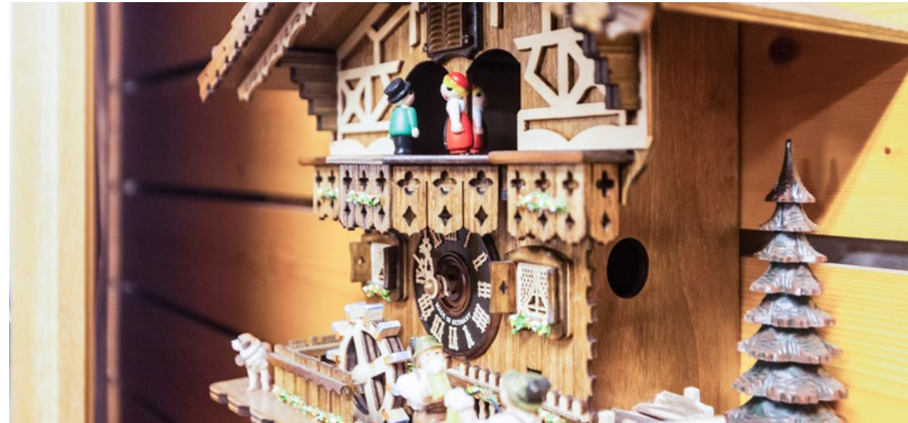
BLACK FOREST CUCKOO CLOCKS