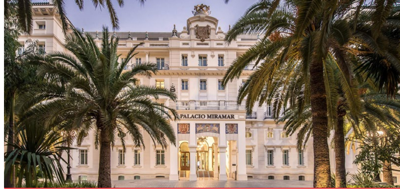
RESTAURANTE PRÍNCIPE DE ASTURIAS

Due to the current situation, the Sunday lunch location will be announced on a later stage.