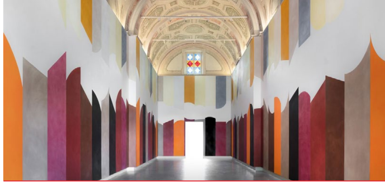
RELAIS SAN MAURIZIO

Just before the dinner start, by the Michelin starred La Ciau del Tornavento, you will have exclusive access to the wine cellar and enjoy a private wine tasting with a local expertise explanation.