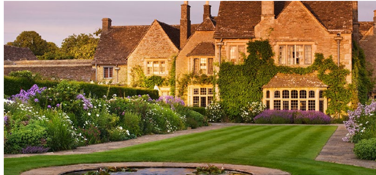
NIALL KEATING BY THE DINING ROOM