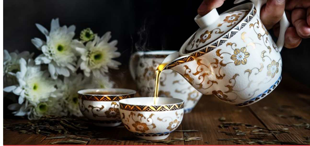
THE PERFECT TEA BREAK

Immerse yourself in a series of exclusive activities at one of Britain's top-tier polo clubs is more than just a lesson or a game – it is a foray into a world of unparalleled recreational delight and a unique physical pastime. Established in 1894, amid 3000 acres of parkland and woodland on one of the country's most beautiful parks, it offers the highest level of polo whilst retaining the charm of a delightfully relaxed country polo club.