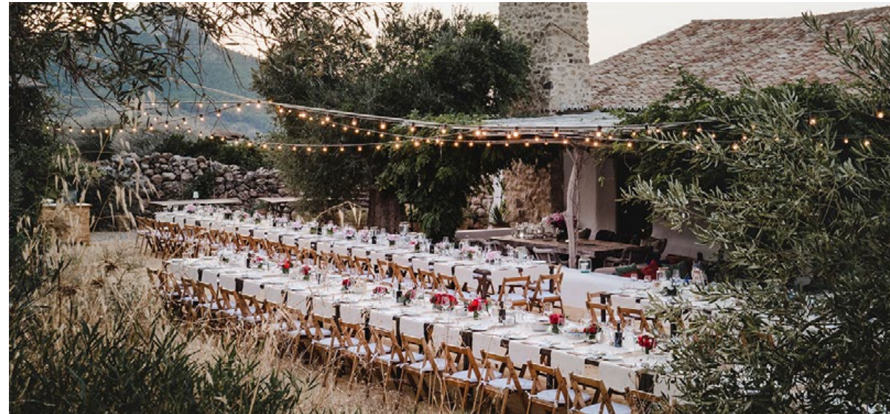
FINCA LA DONAIRA