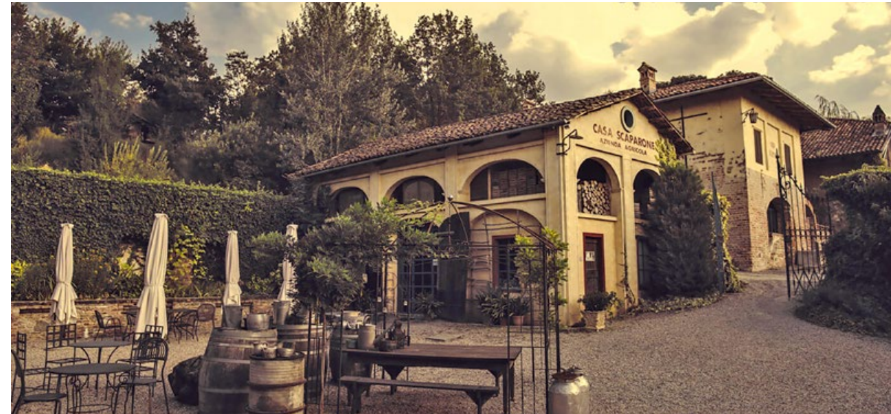
BORGIO CASA SCAPARONE

La Scolca is the cradle of Gavi, the most well-known white wine from Piedmont. Here are born its most famous products, such as the Black Label, bottled in packaging with an unmistakable retro taste. A perfect place to enjoy a lunch in the wonderful Piedmont landscape.