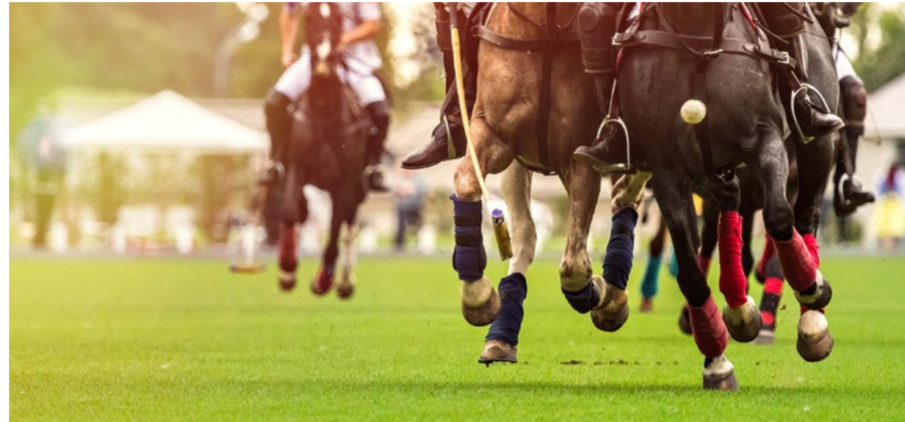
PRIVATE POLO MATCH AND LESSON