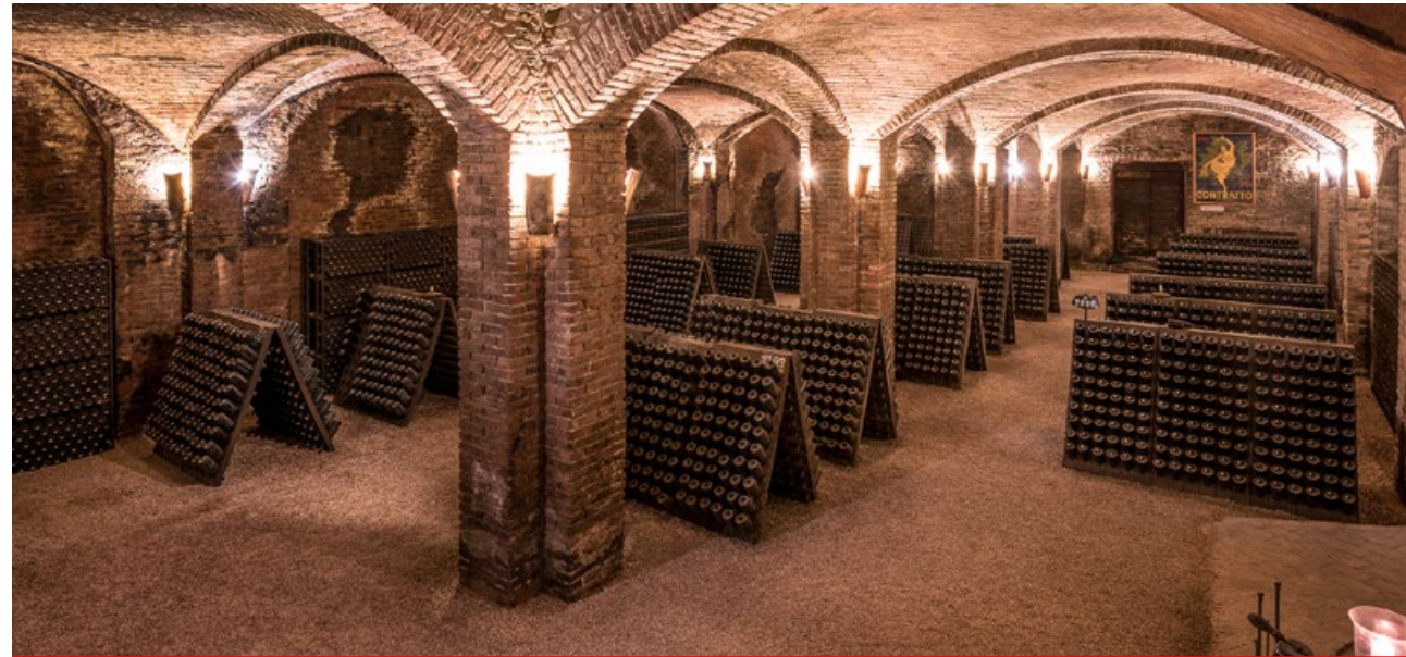
CANTINE CONTRATTO WINE CELLAR