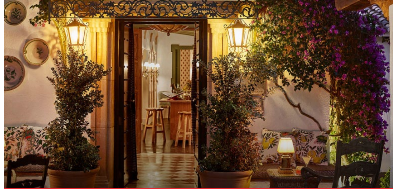
MARBELLA CLUB DINNER

Relax on the seafront with a glass of Champagne as you watch the waves rolling onto the golden sand. On the outdoor decking you can embrace the natural surroundings of the palm-fringed promenade showcasing the impressive mountainous backdrop of La Concha.