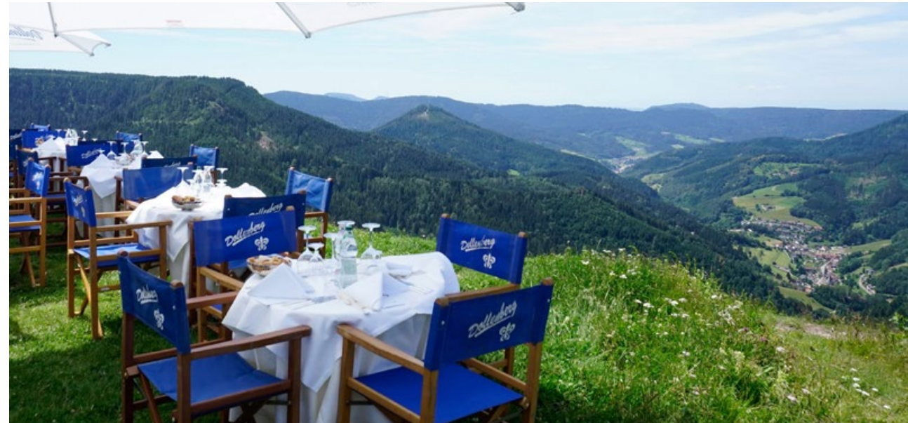
DOLLENBERG RESTAURANT OPEN AIR