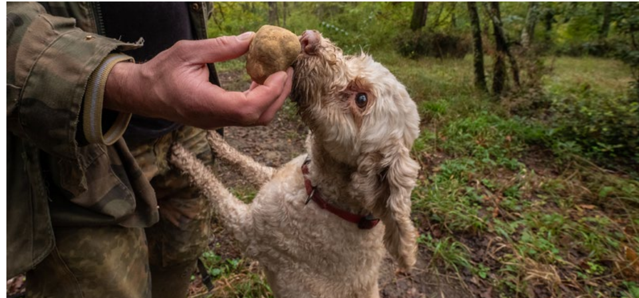
TRUFFLE HUNTING AND TASTING