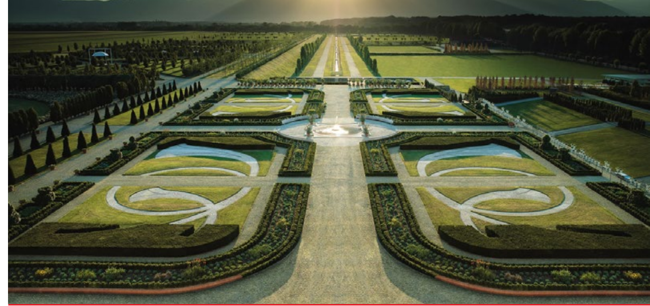
DOLCE STIL NOVO ALLA REGGIA

On the last floor, just above Diana's Gallery and one step below the sky, there is Dolce Stil Novo's restaurant, the only restaurant inside a royal palace, with a breathtaking view over the Gardens, the Fishpond, the Courtyard of Honour and the Deer Fountain. During accreditation time you can enjoy an aperitif on the Reggia Venaria terrace or a guided tour of the palace, for a unique trip between culinary pleasure and history's emotion.