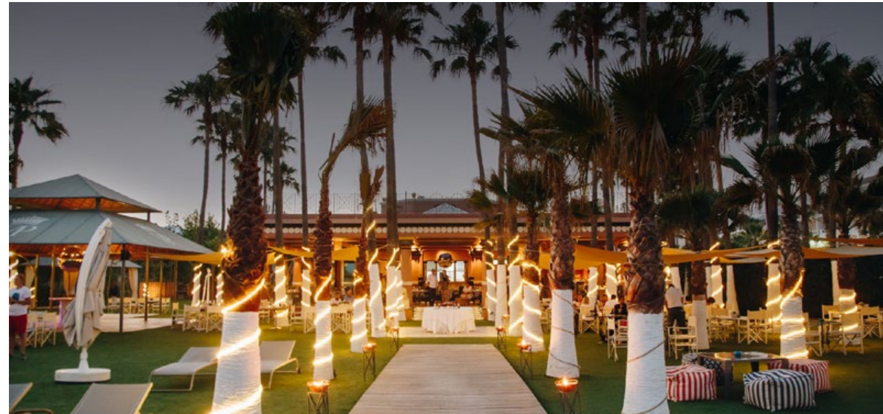
BEACH DINNER AND AFTER-DINNER